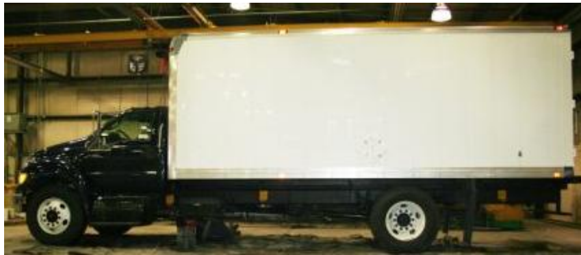
Figure 1: Ford F-750 Box Truck

Item Description: The subject item is identified to be a two axle Ford F750 21' box truck. It measures approximately 363" L x 96" W x 139" H. The vehicle weighs approximately 14,480 lbs and has a gross vehicle weight rating (GVWR) of 25,999 lbs. The front axle is reported to weigh 6,460 lbs with a rating of 10,000 lbs and the rear axle is reported to weigh 3,229 lbs with a rating of 21,000 lbs.