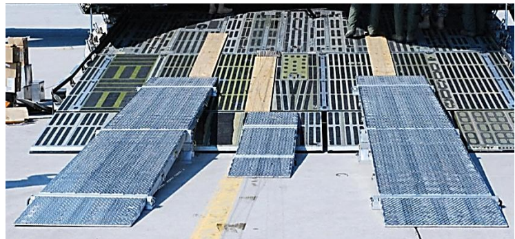
Figure 3: DAMAS 10K & 26K used for helicopters